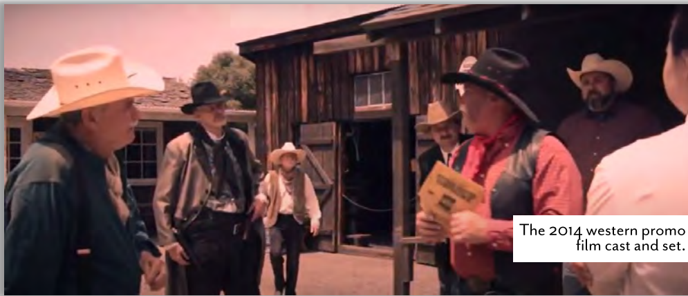
The 2014 western promo film cast and set.

We know that sometimes training sessions and videos can be boring, so it was our goal to make them memorable. What began as a short blurb about the event in 2012 turned into a Twilight Zone inspired promo (2013), which turned into an all-out, old-fashioned western promo (2014), which turned into a fishing trip (2015), which turned into many, many more unique, funny, or thought-provoking promo films. We've filmed on a sailboat, in a classic VW Bug, in a small biplane, and in many more fun places. But the creativity didn't just stop with the promo film. From the start of Storm Water Awareness Week, the event was formatted to be comprised of in-person workshops hosted by storm water professionals and broadcasted keynote videos which highlighted the theme of the year. These keynotes originally started as live-streamed broadcasts from sets built in the WGR Southwest, Inc. studio, but in 2016 they turned into in-the-field documentaries when Storm Water Awareness Week partnered with SeaWorld San Diego to learn about treatment systems and pathogens in our waterways. Since 2016, the keynotes have