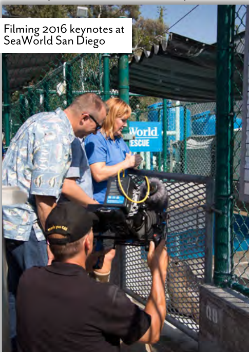
Filming 2016 keynotes at SeaWorld San Diego